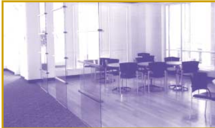
Combining wood or laminate with other floor finishes creates separation in interiors that offer an appealing mix of textures, colors and patterns.

Specifiers and facility managers can specify wood and wood look flooring with confidence. These next-generation natural and manufactured products fuse beauty with technology for floors that satisfy all criteria—aesthetics, performance, easy installation and easy maintenance. When used in full field installations, wood and laminate floors bring warmth and elegance to commercial interiors. When used in combination with other hard and soft