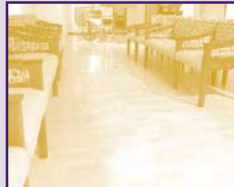
Laminate features the benefits of wood design plus superior durability and easy maintenance.

Laminates install via glue and glueless methods. Both methods produce floating structures that are recommended for installation on any grade level, even high-moisture concrete. Your StarNet member can recommend the right product and installation method to meet your needs.